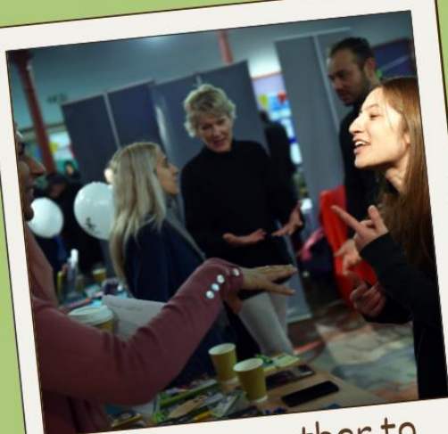
Working together to champion inclusivity