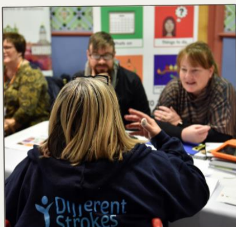
Information and events 29 Nov - 03 Dec