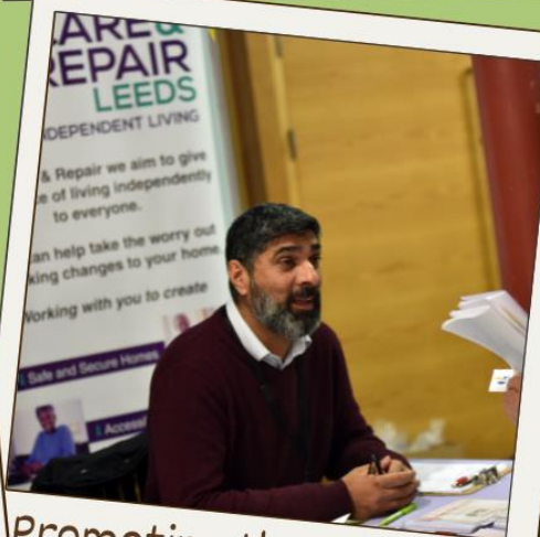
Promoting the range of support available