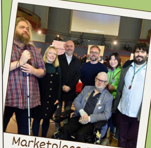
Marketplace event 03 Dec