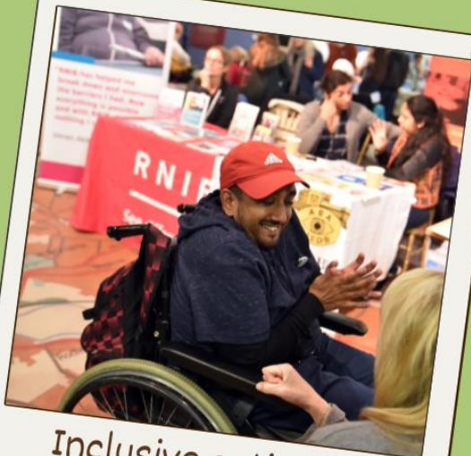
Inclusive activities 29 Nov - 03 Dec