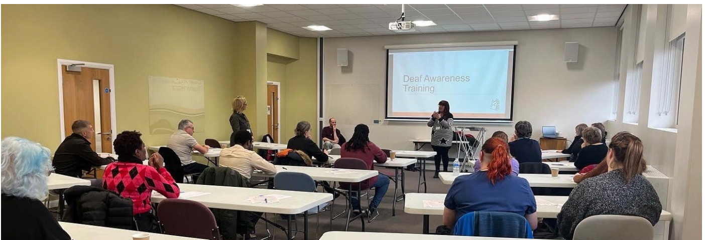
Leeds Involving People - Deaf Awareness Training