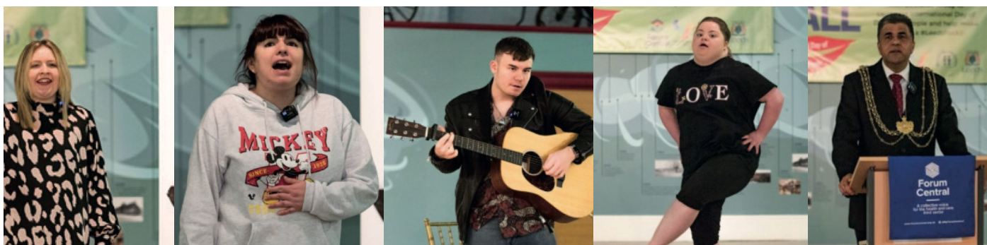
Leeds For All - International Day of Disabled People 2021

The annual observance of the International Day of Disabled People on 3 December aims to promote an understanding of disability issues and mobilise support for dignity, rights and wellbeing of people with disabilities.