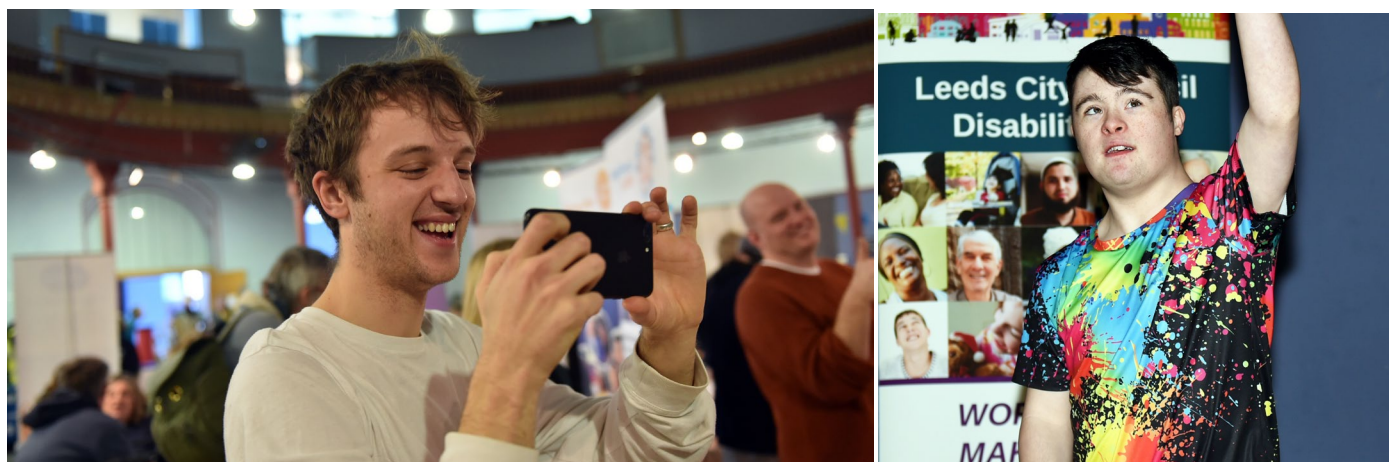
Leeds For All - International Day of Disabled People 2019

The first disabled peoples celebration event was held under the "Leeds for All" banner in 2019 at Leeds City Museum. It was an opportunity for people to reflect, celebrate, raise awareness and to challenge for change. Then in 2020-21 due to the Covid-19 pandemic all celebration events were held virtually.