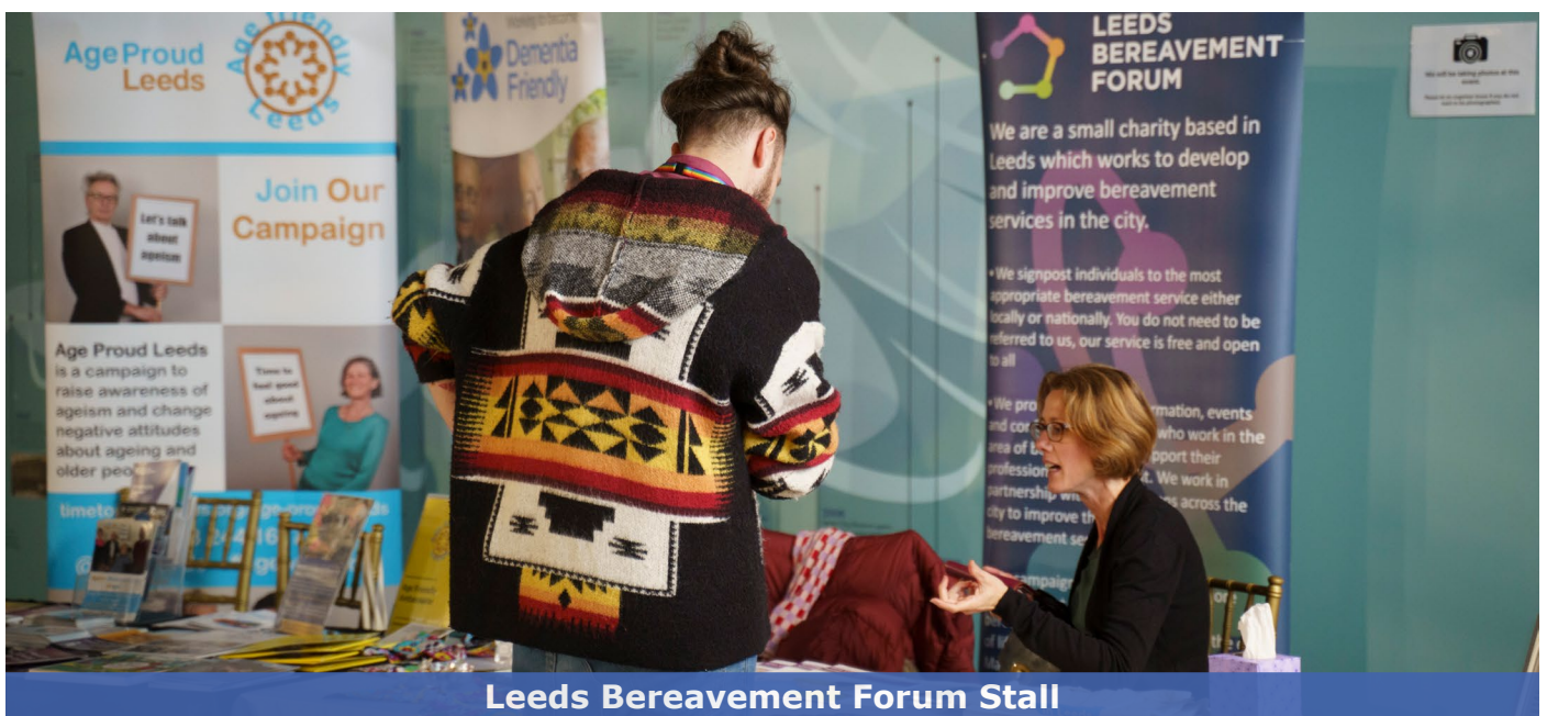
Leeds Bereavement Forum Stall