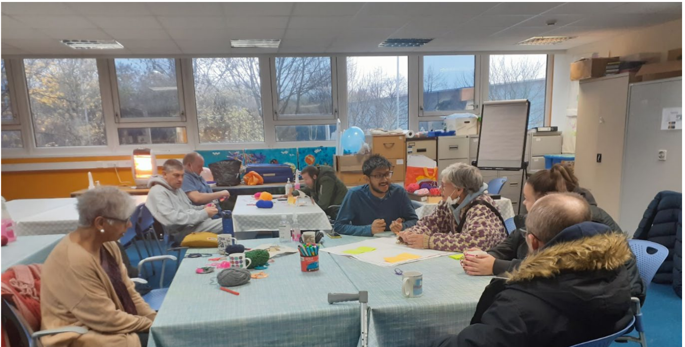
People in Action - Wellbeing Group

The activities celebrated the contributions of disabled people to society and the City of Leeds and to highlight the barriers disabled people still face in fully participating in society. Eight organisations took up this funding and held their activities between December 2022 and January 2023. See group activities summary pages for more information.