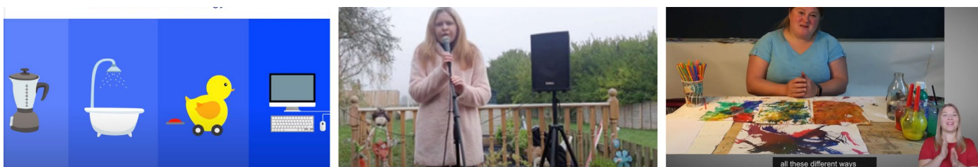
Leeds For All - International Day of Disabled People 2020