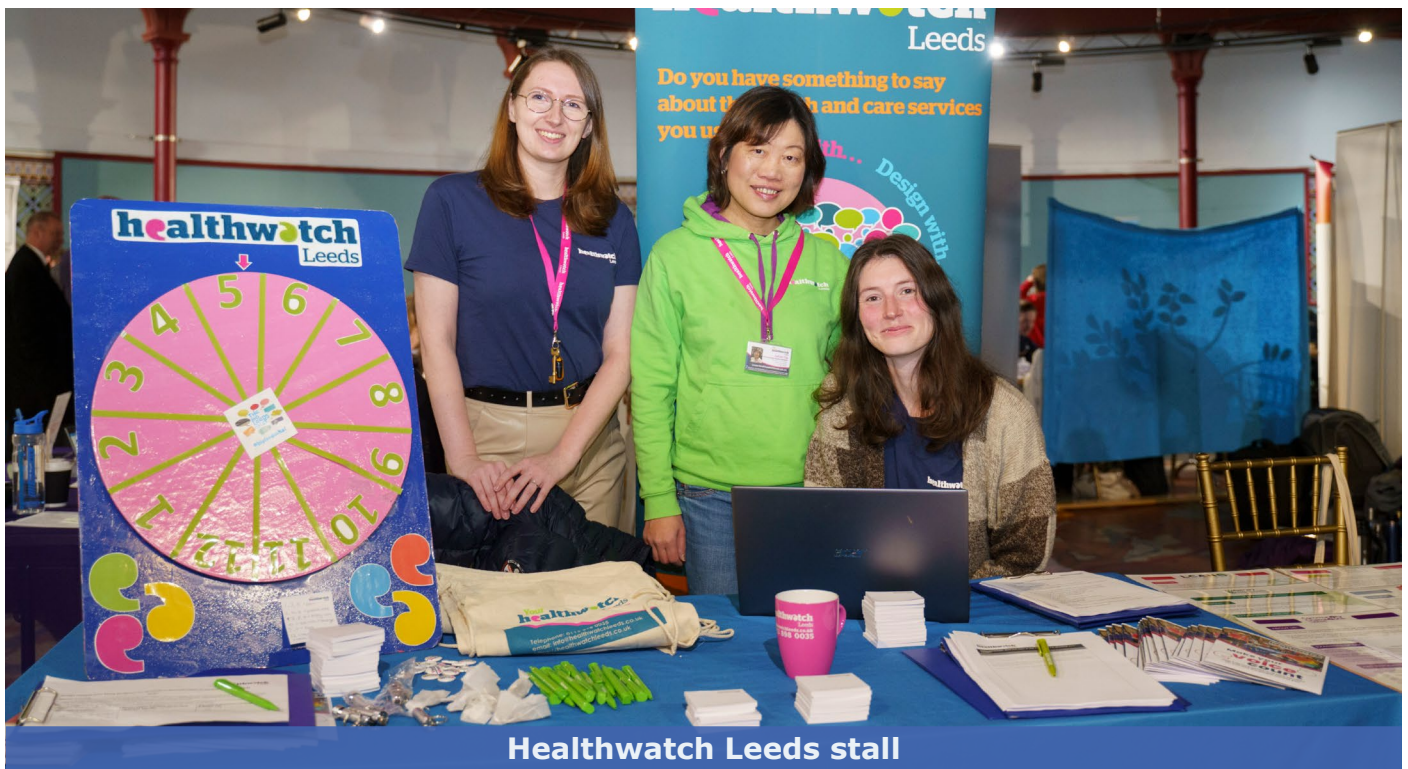
Healthwatch Leeds stall

We also intend to use the small grant funded model again as it gave organisations more ownership over what kind of activities they wanted to run. It also allowed them to better fit the activities into their busy timetables. The highlights people reported to us about holding their activities included the chance to run hybrid events, use all types of social media and most of all to unite, empower and upskill participants. In 2023 we intend to fund more organisations, have more publicity and raise wider awareness and participation at all levels. We want to be Transformative, Innovative and Inclusive!