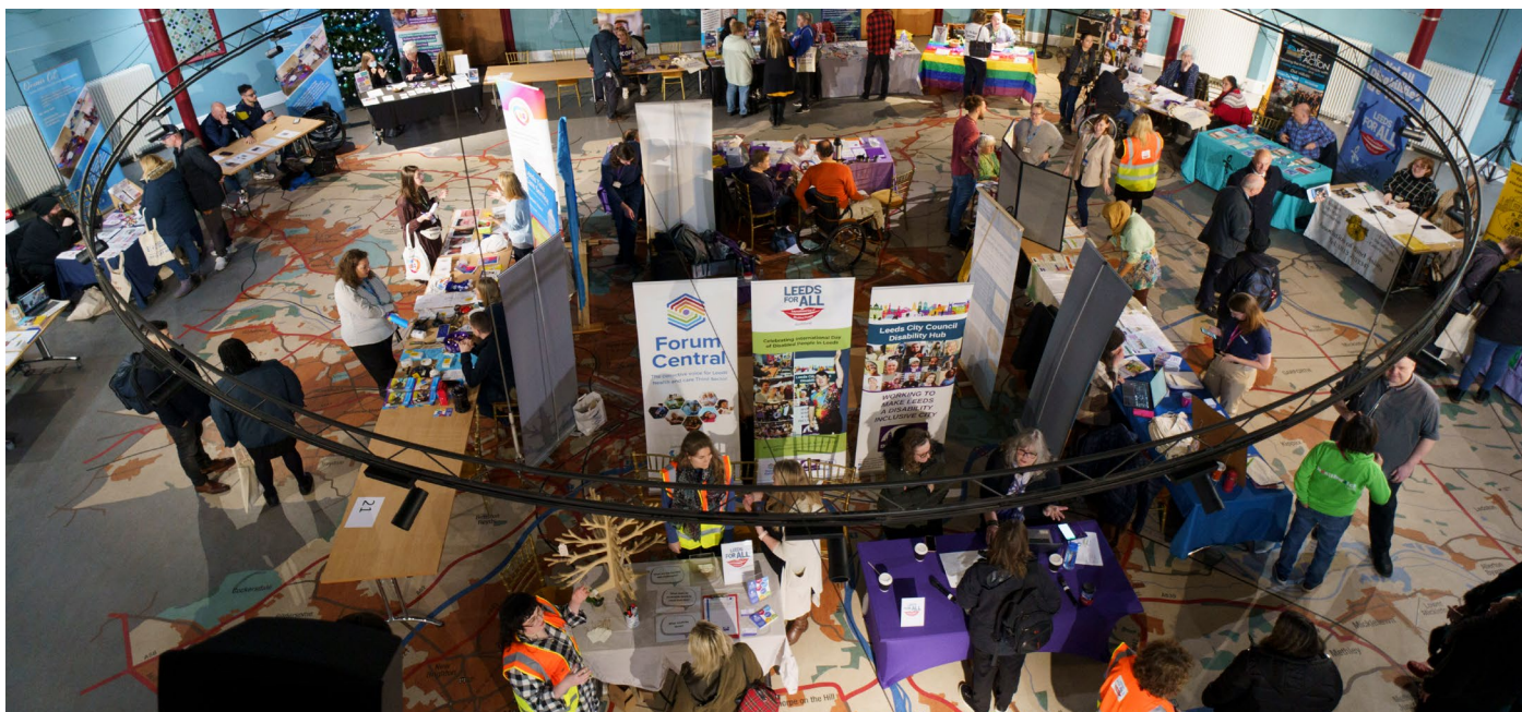
International Day of Disabled People 2022 Marketplace

Due to timescales around vacancies and reduced team capacity in both Forum Central and Leeds City Council's Safer and Stronger Community Teams, we were unable to hold a celebration event with multiple activities like those of the previous two years. We therefore had to scale down our aspirations and recognise that a one day Marketplace Event was the best solution at the time. We also recognise from 2022 feedback there is more we can do to improve promotional materials and to provide autism friendly spaces during subsequent events.