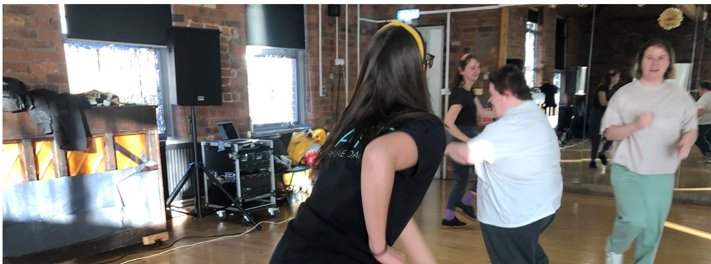
Yorkshire Dance - Grant Funded Activity

See the group activities summary pages where organisations have provided feedback on their own events. This funding model is one that we will seek to use in the future. We are grateful to those city councillors who contributed.